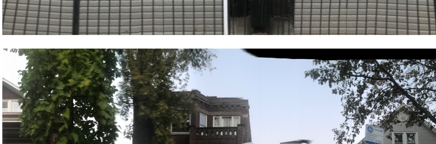
Divyamaan Sahoo // work in progress