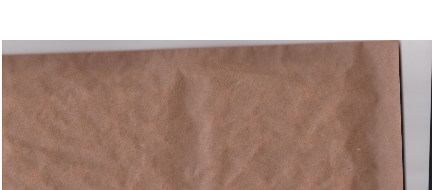
Jocelyn Beausire // Accumulation Roadtrip

Unbuilding Gender by Jack Halberstam // Downloadable PDF